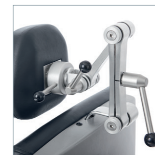
Use of the Vario double joint