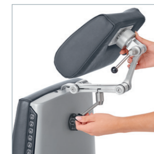
Quick and easy positioning – unique joint fixture