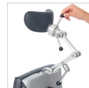
Any position can be fixed with the headrest Ergo, half or full dome