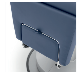
Foldable footrest, optically perfectly integrated into the leg section