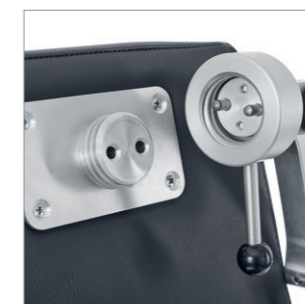
Quick change with Quick Assist