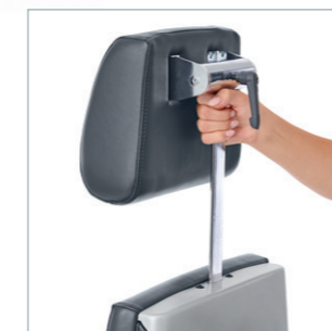
Ergo headrest as standard can be easily exchanged