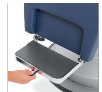
With synchronous adjustment, the step plate moves ergonomically